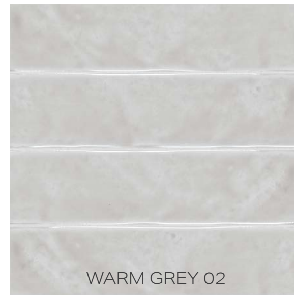
WARM GREY 02