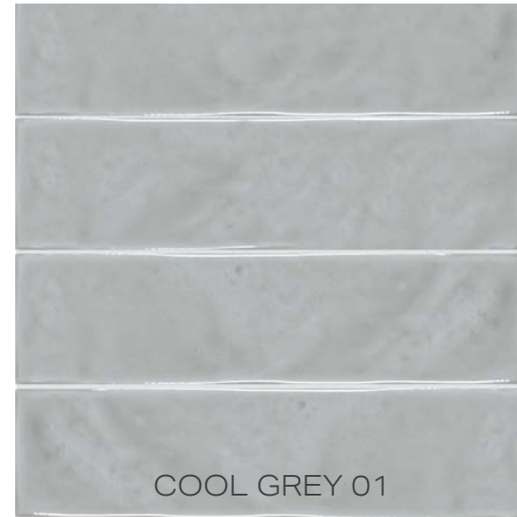
COOL GREY 01

**All technical data was supplied by the manufacturer and is being provided by CMC for informational purposes only. Exact test results should be requested from your CMC contact.