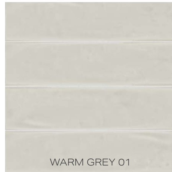
WARM GREY 01