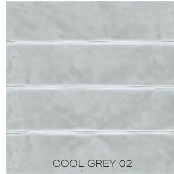
COOL GREY 02