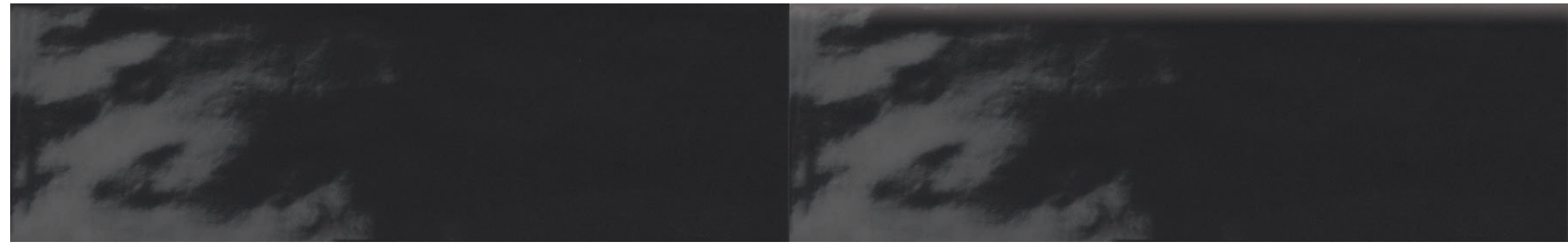
BLACK | TWO PIECES SHOWN

*Ceramic is intended for wall use only. All technical data was supplied by the manufacturer and is being provided by CMC for informational purposes only. Exact test results should be requested from your CMC contact.