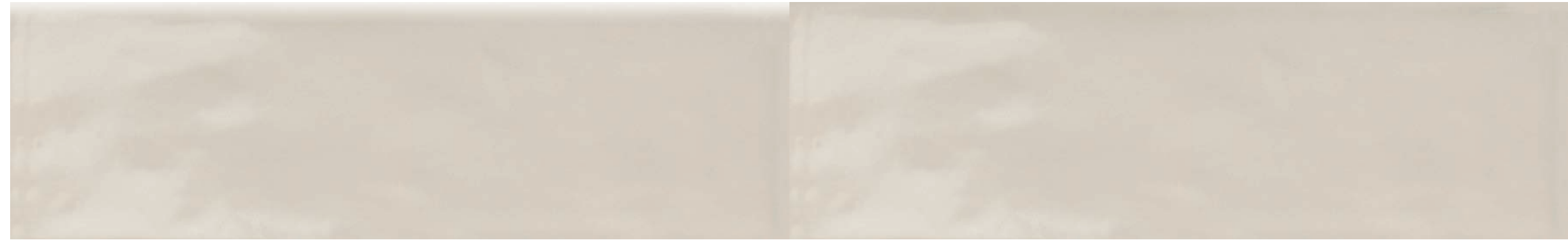
GREY | TWO PIECES SHOWN