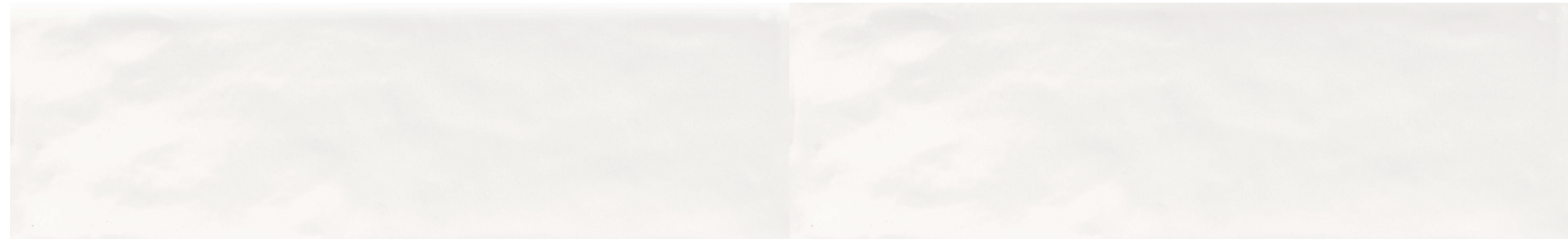
WHITE | TWO PIECES SHOWN