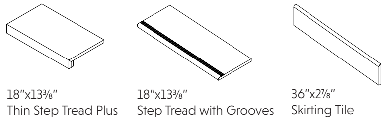
18"x13 3 / 8 "