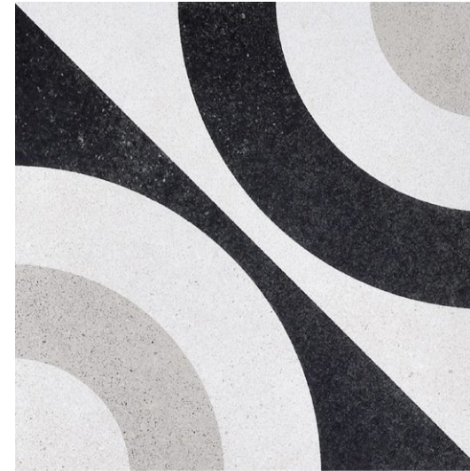
BLACK & WHITE PATTERN 5