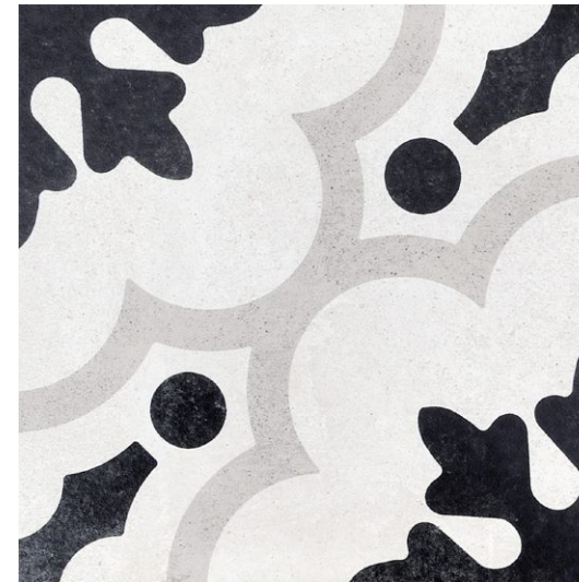
BLACK & WHITE PATTERN 2