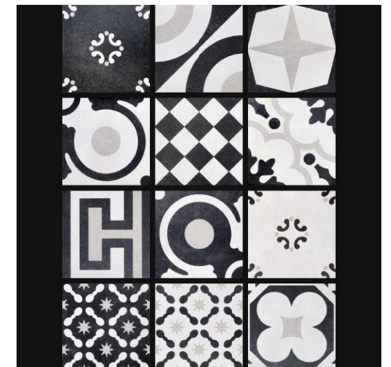
BLACK & WHITE PATTERN MIX