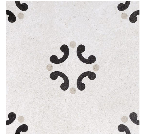
BLACK & WHITE PATTERN 3