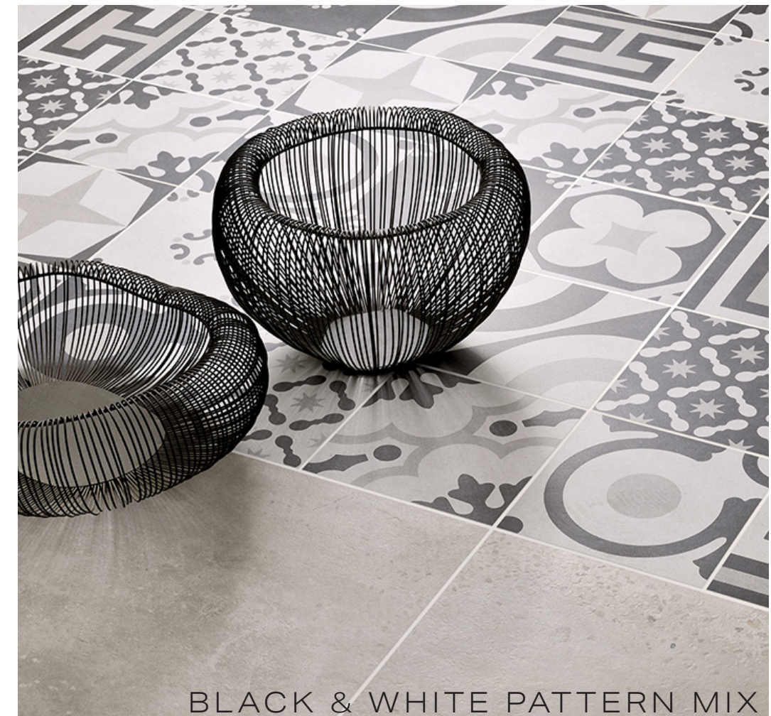
BLACK & WHITE PATTERN MIX

DISTINCTION BRINGS TWELVE DECORATIVE PATTERNS TO LIFE WITH MONOCHROME VARIATIONS. ATTENTIVE TO THE LATEST TRENDS IN THE WORLD OF FASHION AND INTERIOR DESIGN.