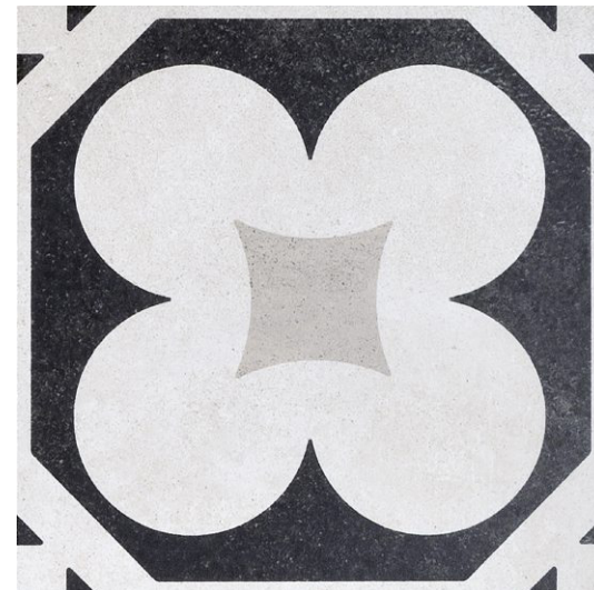
BLACK & WHITE PATTERN 4