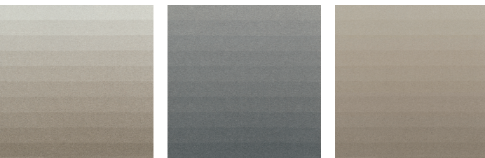
Fade TR 01-03*