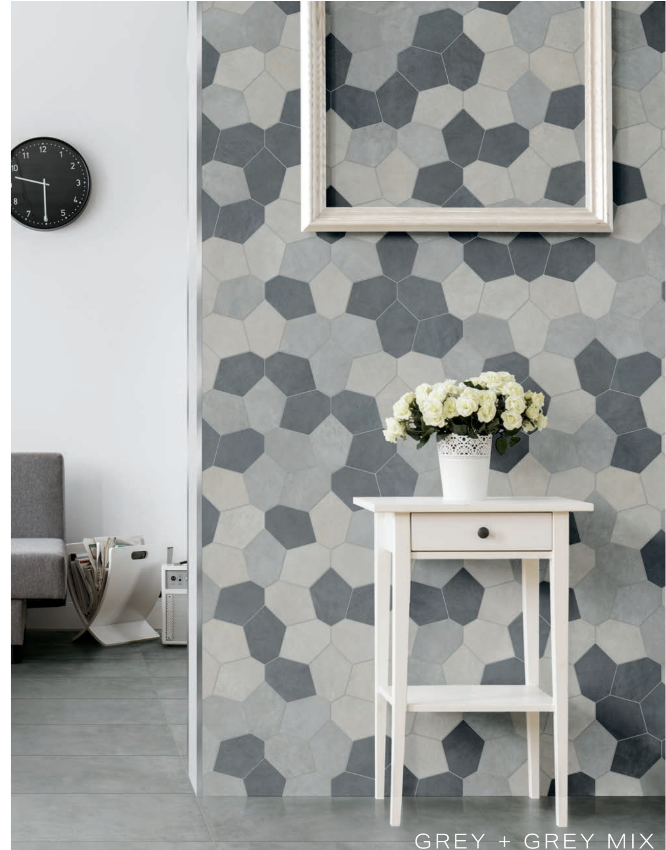
GREY + GREY MIX