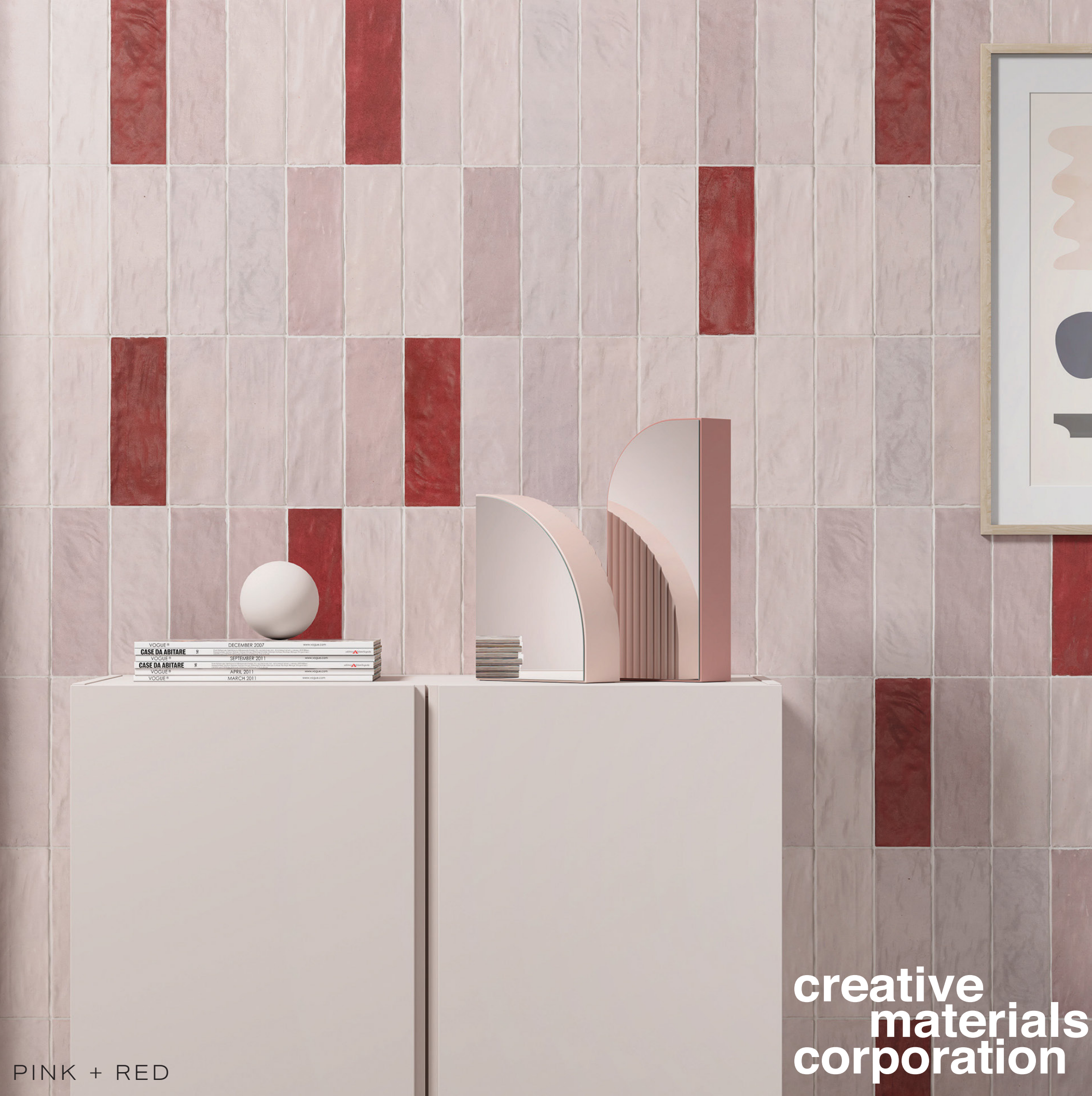
PINK + RED

TANGIER BEAUTIFULLY CAPTURES THE HANDMADE LOOK USED FOR CENTURIES THROUGHOUT THE WORLD. THE COLOR COMBINATIONS OF THE PALETTE ARE ARTFUL FOR EXQUISITE BLENDS WHEN USED TOGETHER OR ARE ON THEIR OWN FOR TONAL APPRECIATION.