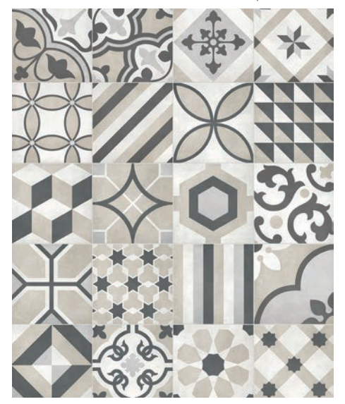
Pattern Mix 8"x8"x9mm Matte | Patterns Sold Individually