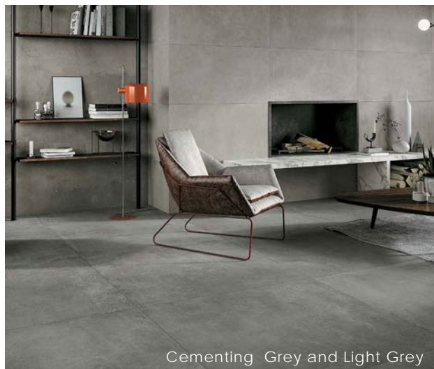
Cementing Grey and Light Grey