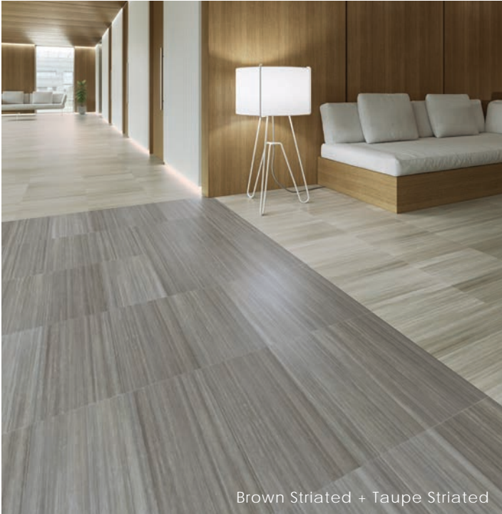
Brown Striated + Taupe Striated