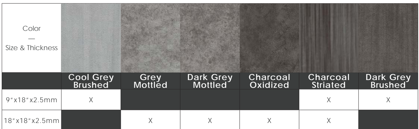
Chart indicates available size, color, finish and thickness options. Shaded block indicates not available. Sizing is nominal for field tile, trims, and decors.