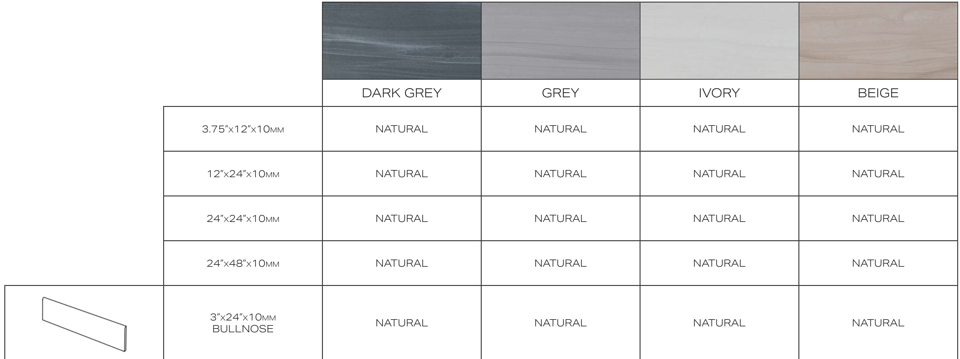
CHART INDICATES AVAILABLE SIZE + THICKNESS + FINISH OPTIONS. IF GREY BLOCK IS PRESENT, THE PRODUCT IS NOT AVAILABLE IN THAT SIZE. SIZING IS NOMINAL FOR FIELD TILE, TRIMS, AND DECORS.