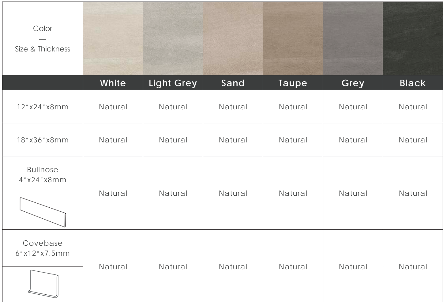
Chart indicates available size, color, finish and thickness options. Shaded block indicates not available. Sizing is nominal for field tile, trims, and decors.