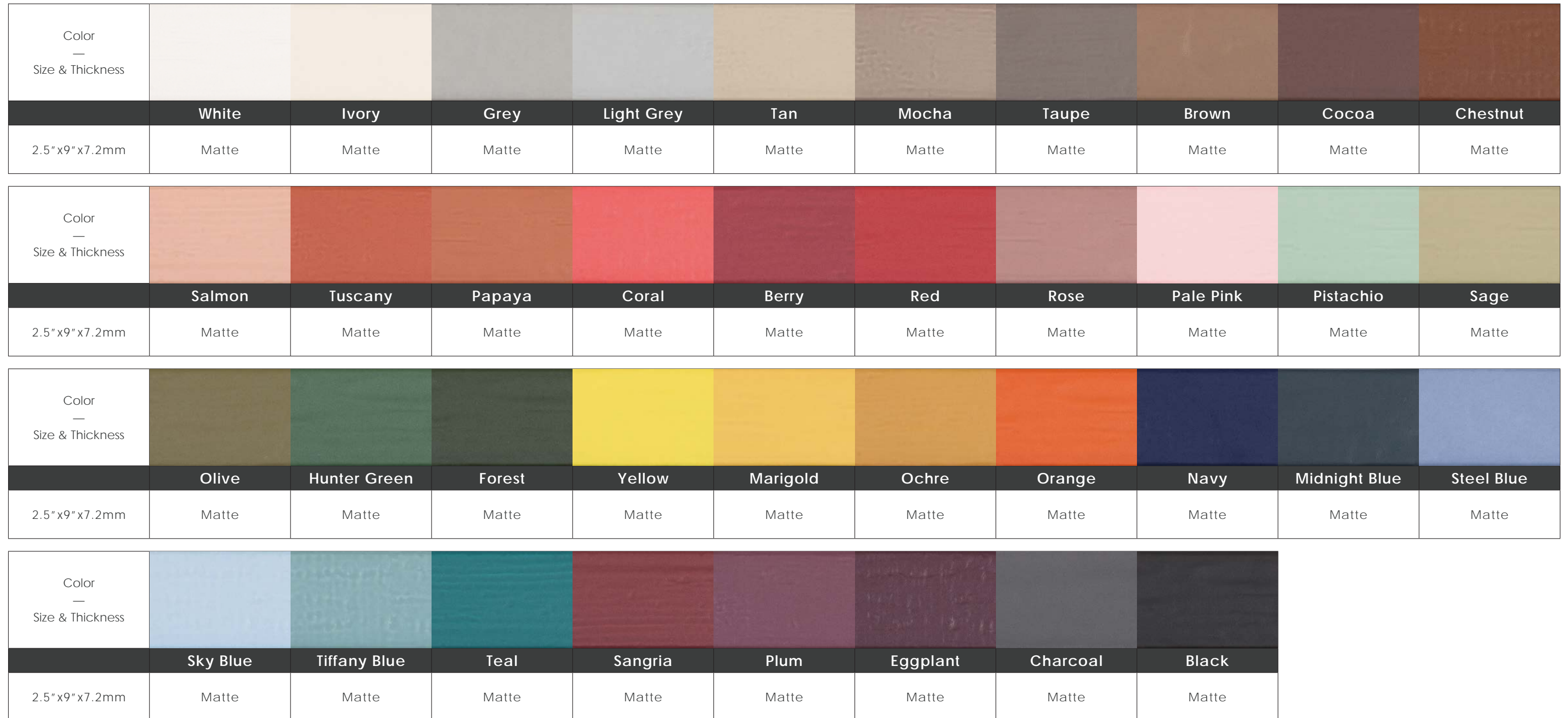
Chart indicates available size, color, finish and thickness options. Shaded block indicates not available. Sizing is nominal for field tile, trims, and decors.