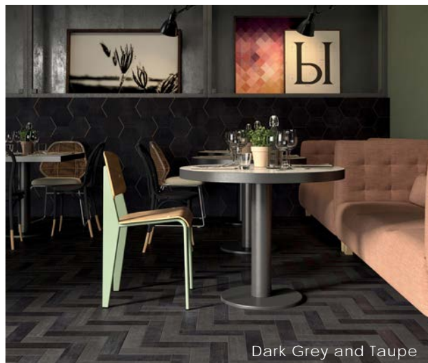
Dark Grey and Taupe