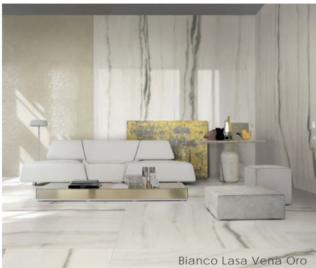
Bianco Lasa Vena Oro

Mindful Materials (mM) is a database and platform aimed at increasing transparency in the building materials industry by providing easy access to information on the human health and environmental impacts of products. It serves as a resource for architects, designers, and building professionals, aiding them in making informed and sustainable material choices; with a focus on sustainability and health.