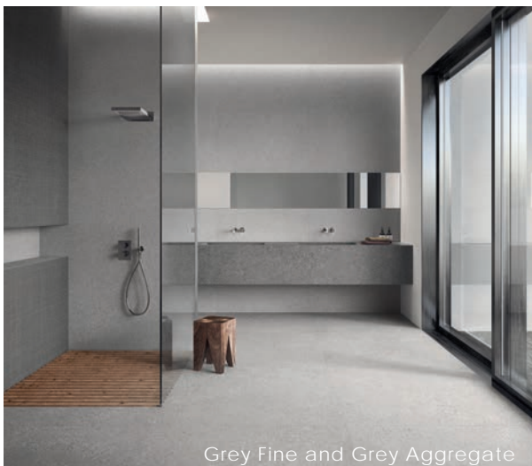
Grey Fine and Grey Aggregate

An Environmental Product Declaration (EPD) is a standardized document that provides detailed information about the environmental impact of a product throughout its lifecycle. It's a key tool in assessing the sustainability of products, especially in sectors like construction and manufacturing. It is a tool for measuring and communicating the environmental performance of a product across its entire lifecycle.