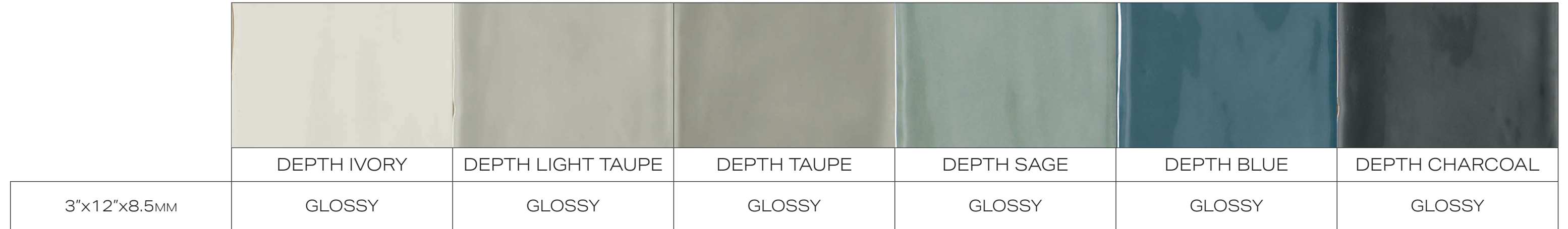
CHART INDICATES AVAILABLE SIZE + THICKNESS + FINISH OPTIONS. IF GREY BLOCK IS PRESENT, THE PRODUCT IS NOT AVAILABLE IN THAT SIZE. SIZING IS NOMINAL FOR FIELD TILE, TRIMS, AND DECORS.