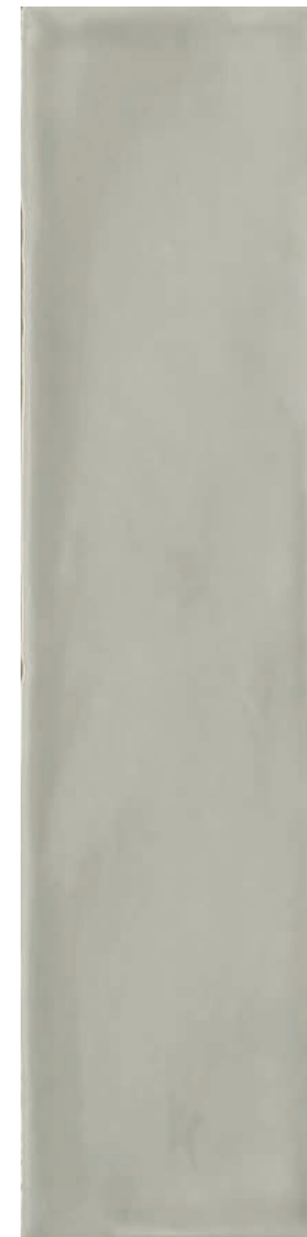
DEPTH LIGHT TAUPE