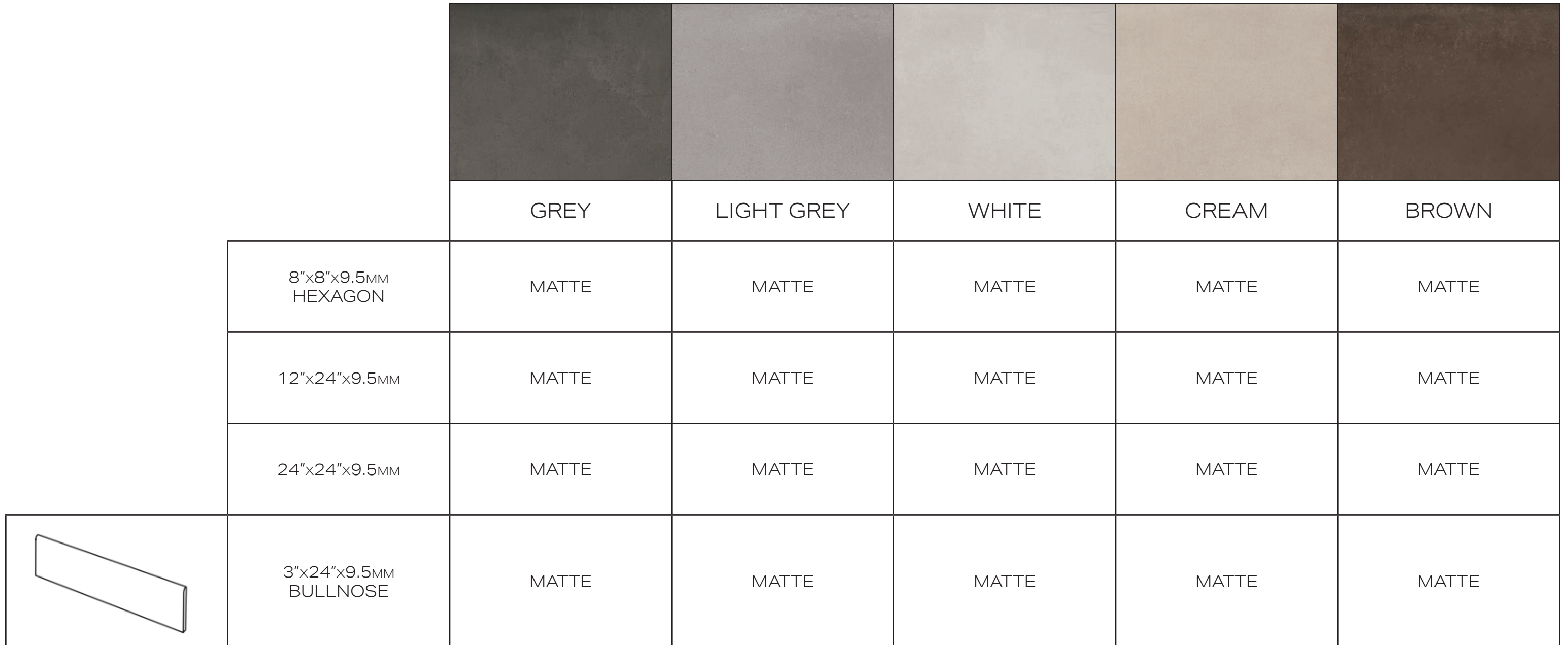
CHART INDICATES AVAILABLE SIZE + THICKNESS + FINISH OPTIONS. IF GREY BLOCK IS PRESENT, THE PRODUCT IS NOT AVAILABLE IN THAT SIZE. SIZING IS NOMINAL FOR FIELD TILE, TRIMS, AND DECORS.