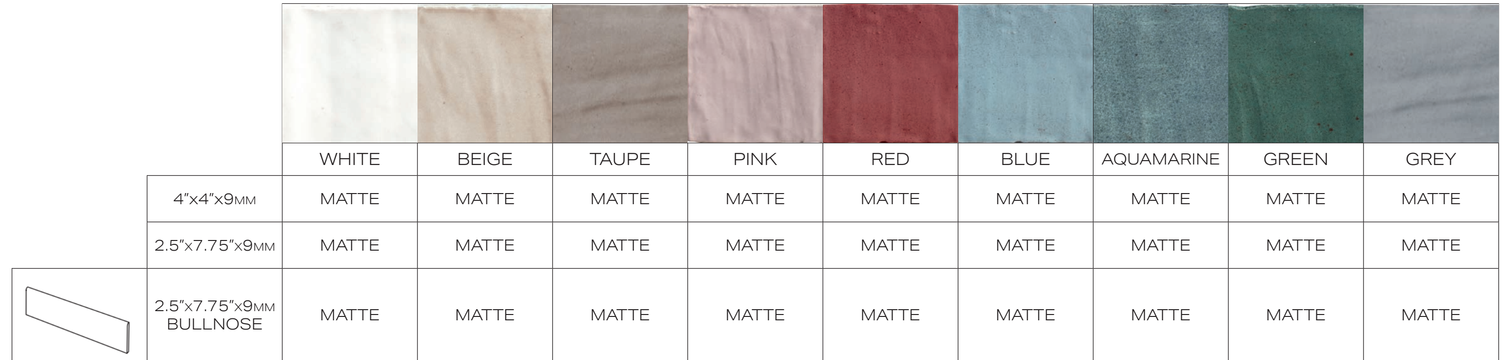
CHART INDICATES AVAILABLE SIZE + THICKNESS + FINISH OPTIONS. IF GREY BLOCK IS PRESENT, THE PRODUCT IS NOT AVAILABLE IN THAT SIZE. SIZING IS NOMINAL FOR FIELD TILE, TRIMS, AND DECORS.