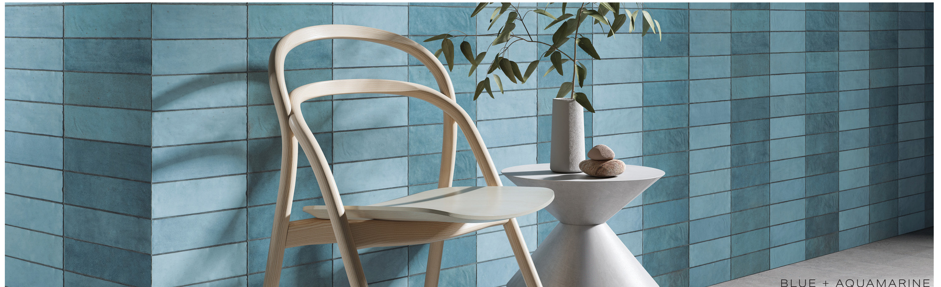
BLUE + AQUAMARINE