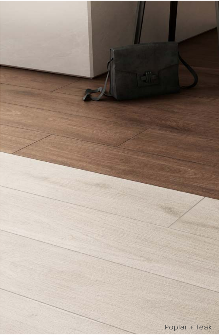
Poplar + Teak