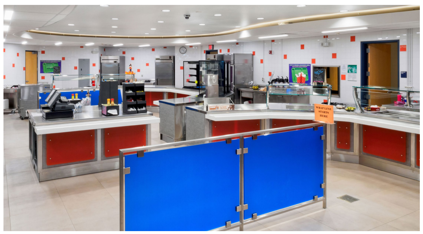
Columbia High School Cafeteria

The Creative Materials team ensures that sourcing tile is the least of a designer's worries. Creative Materials helped CSArch successfully transform the cafeteria into an updated, versatile space for students and the public.