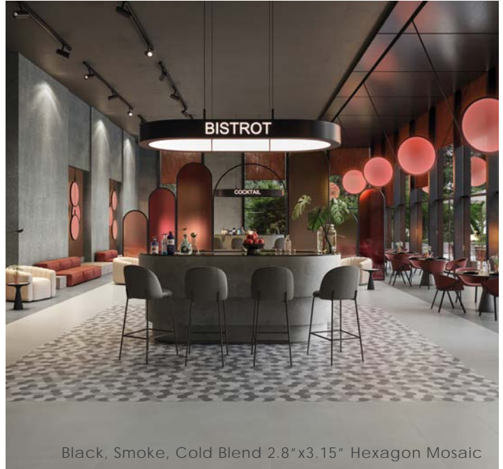
Black, Smoke, Cold Blend 2.8" x 3.15" Hexagon Mosaic