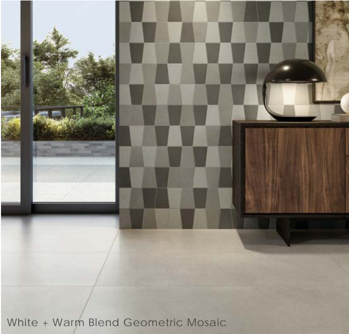
White + Warm Blend Geometric Mosaic