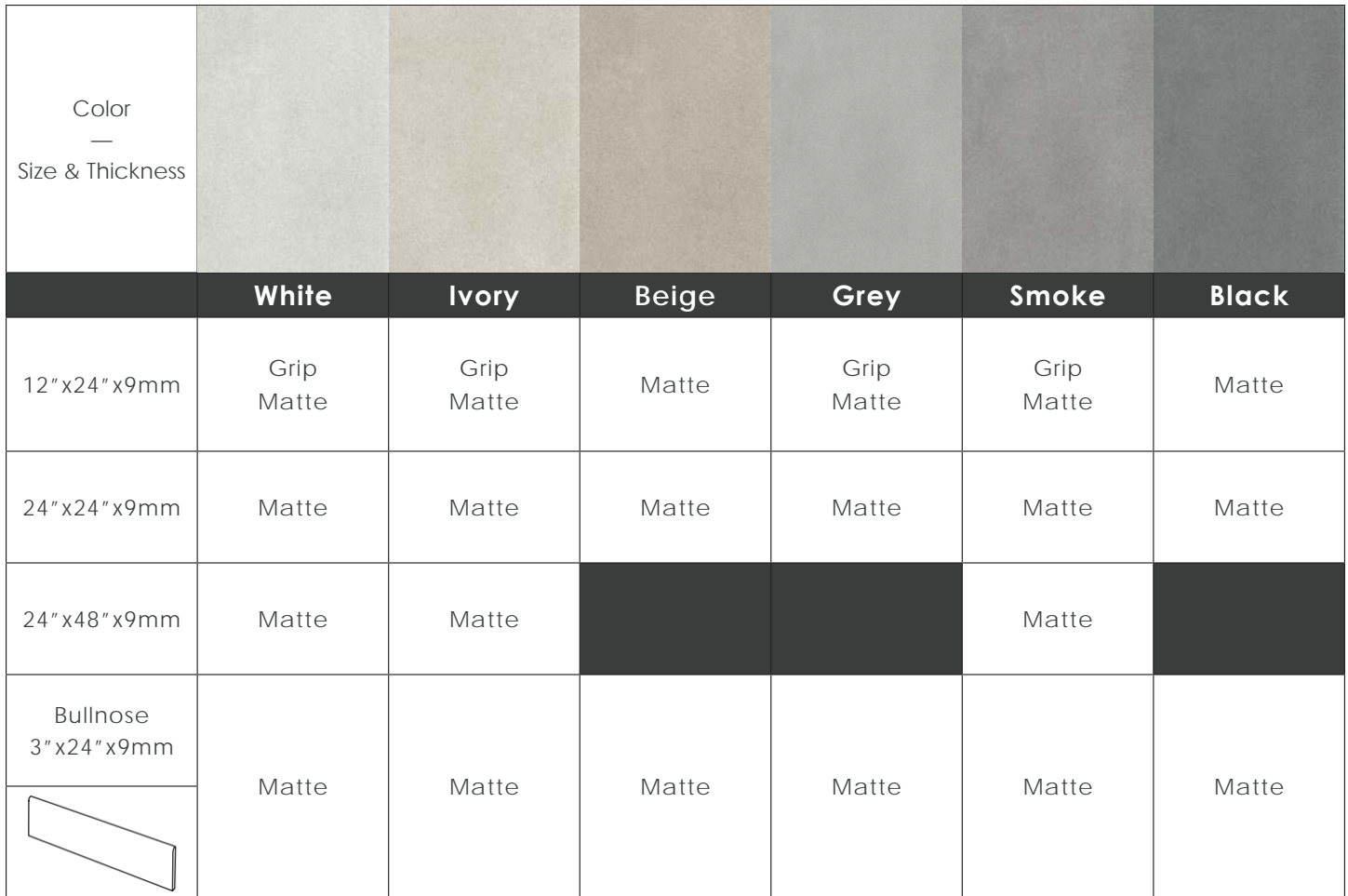
Chart indicates available size, color, finish and thickness options. Shaded block indicates not available. Sizing is nominal for field tile, trims, and decors.