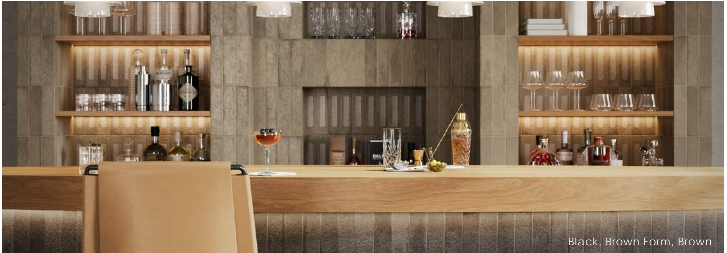
Black, Brown Form, Brown