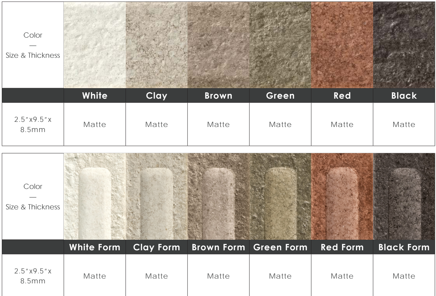
Chart indicates available size, color, finish and thickness options. Shaded block indicates not available. Sizing is nominal for field tile, trims, and decors.