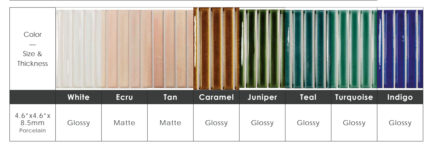
Chart indicates available size, color, finish and thickness options. Shaded block indicates not available. Sizing is nominal for field tile, trims, and decors.