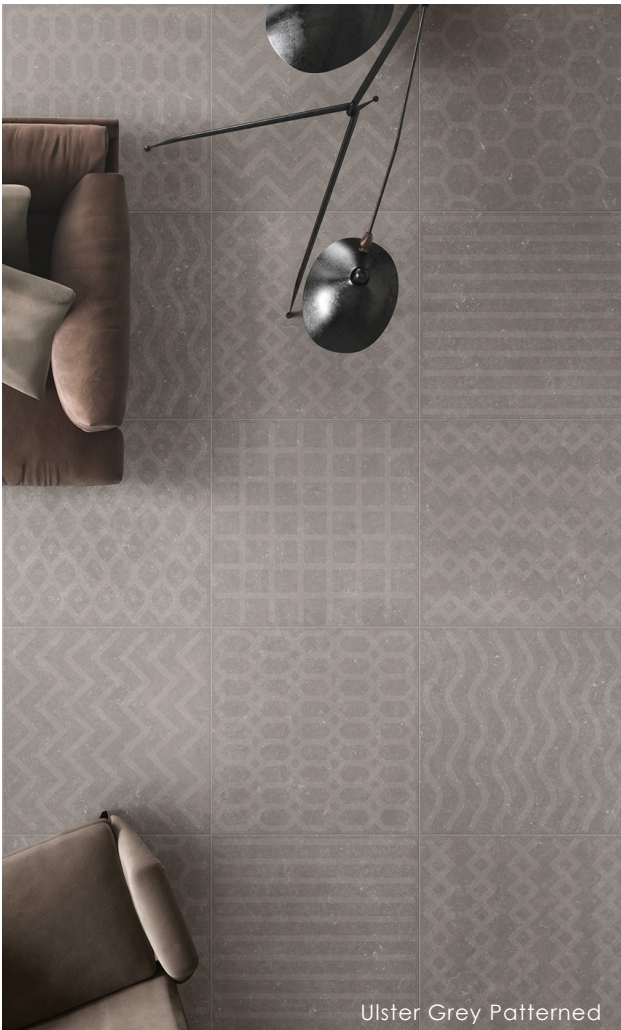
Ulster Grey Patterned

The Declare Label - Red List Free Declare Label, is a transparency tool and eco-label in the building industry. It focuses on promoting the use of materials that are free from harmful chemicals and toxins. Products that achieve "Red List Free" status do not contain any of the chemicals or elements listed on the International Living Future Institute's (ILFI) Red List. These include items, such as asbestos, known to pose serious health risks.