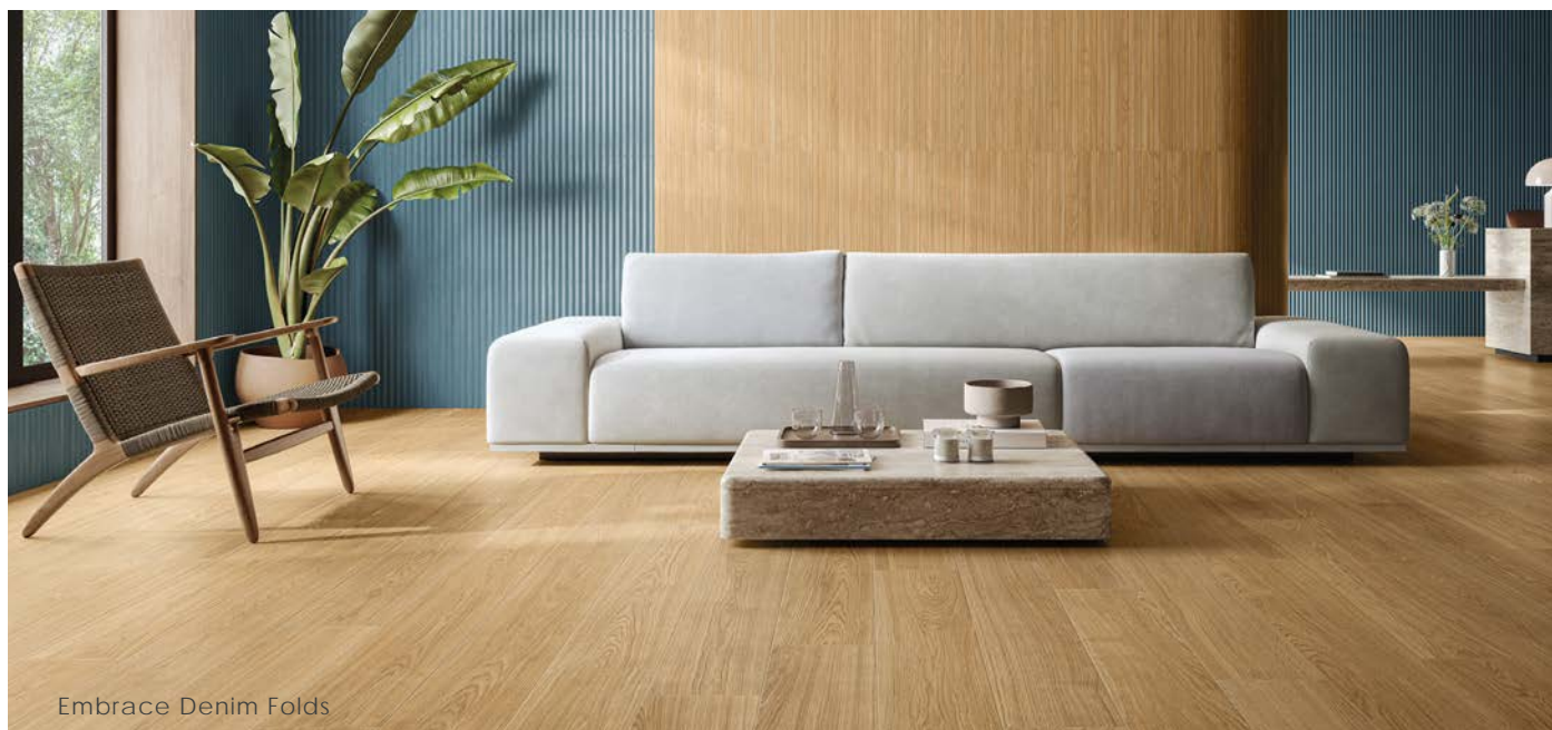
Embrace Denim Folds

A Health Product Declaration (HPD) is a standardized tool used in the building industry to report the material contents of building products and their health effects. This tool is particularly important for architects, builders, and consumers who are focused on creating healthy, sustainable environments. It provides detailed information about the chemical ingredients in a product and their potential health impacts.