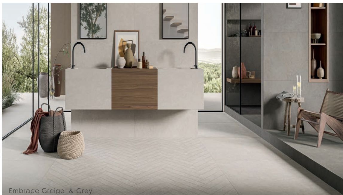
Embrace Greige & Grey