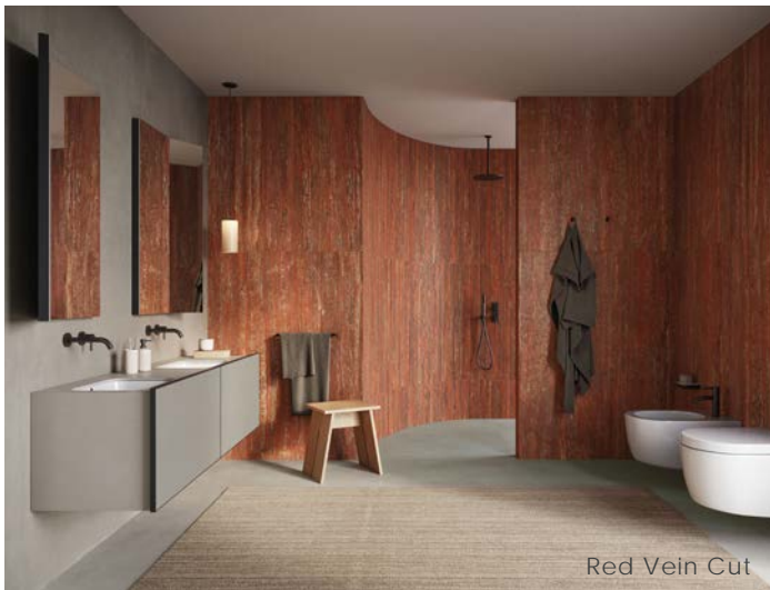
Red Vein Cut

A Health Product Declaration (HPD) is a standardized tool used in the building industry to report the material contents of building products and their health effects. This tool is particularly important for architects, builders, and consumers who are focused on creating healthy, sustainable environments. It provides detailed information about the chemical ingredients in a product and their potential health impacts.