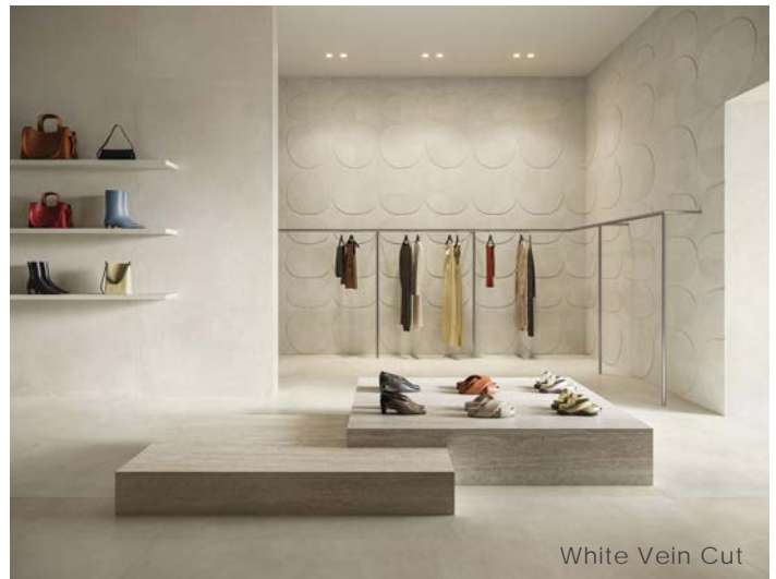
White Vein Cut