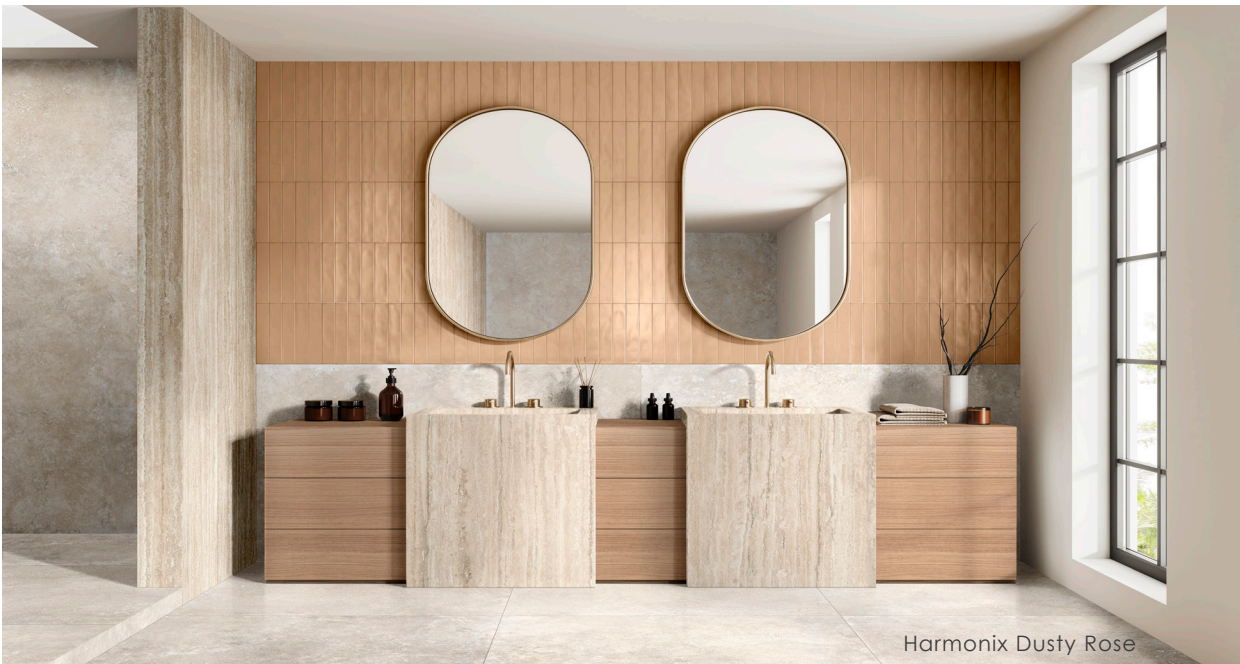
Harmonix Dusty Rose