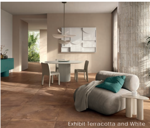
Exhibit Terracotta and White

An Environmental Product Declaration (EPD) is a standardized document that provides detailed information about the environmental impact of a product throughout its lifecycle. It's a key tool in assessing the sustainability of products, especially in sectors like construction and manufacturing. It is a tool for measuring and communicating the environmental performance of a product across its entire lifecycle.