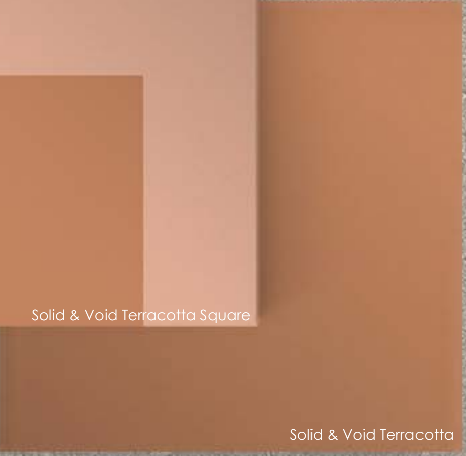
Solid & Void Terracotta