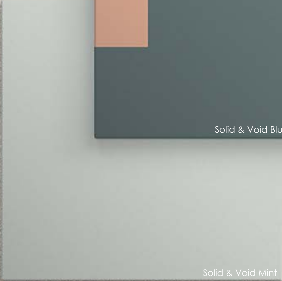
Solid & Void Mint