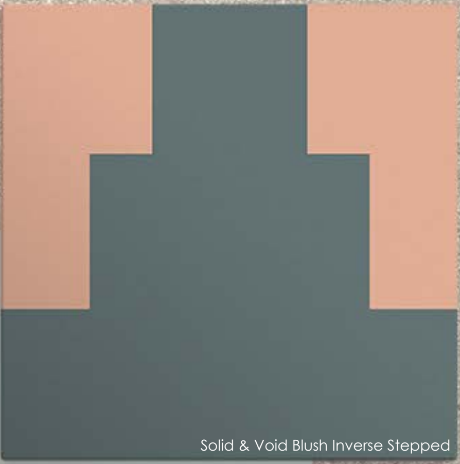
Solid & Void Blush Inverse Stepped