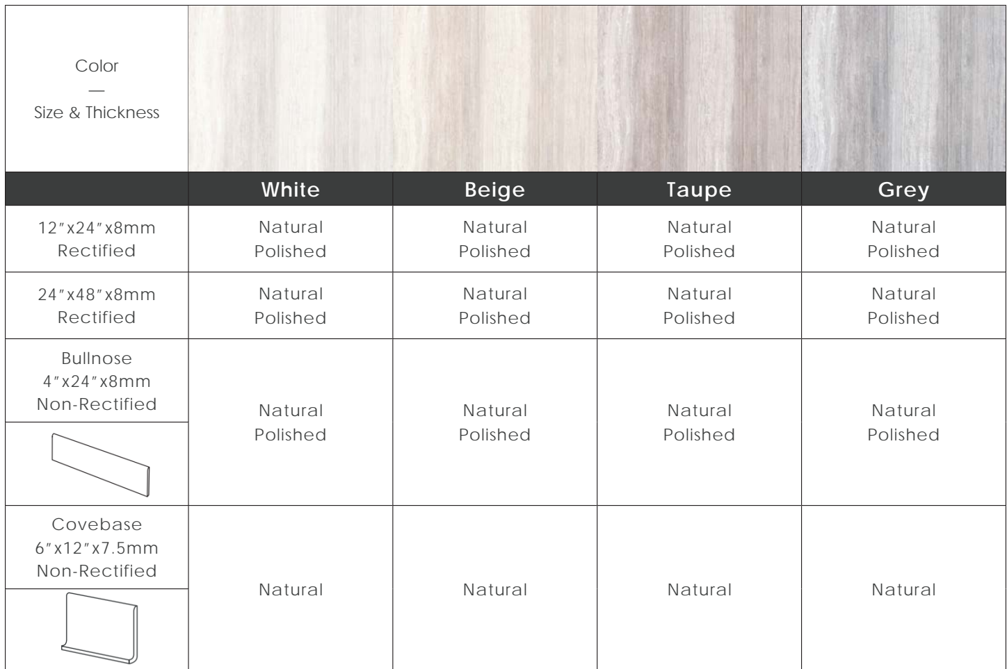
Chart indicates available size, color, finish and thickness options. Shaded block indicates not available. Sizing is nominal for field tile, trims, and decors.