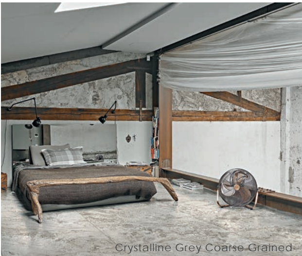
Crystalline Grey Coarse Grained

An Environmental Product Declaration (EPD) is a standardized document that provides detailed information about the environmental impact of a product throughout its lifecycle. It's a key tool in assessing the sustainability of products, especially in sectors like construction and manufacturing. It is a tool for measuring and communicating the environmental performance of a product across its entire lifecycle.