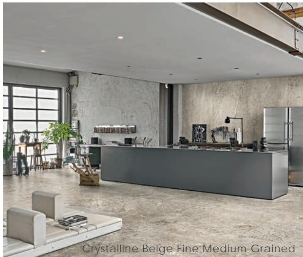
Crystalline Beige Fine Medium Grained