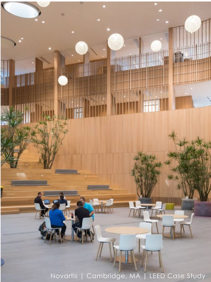
Novartis | Cambridge, MA | LEED Case Study

At Creative Materials, many of our tile products are suitable for LEED projects and green building practices. We are proud to have contributed to LEED-certified projects ranging from Certified to Platinum. If you are in the planning phase of a project, our experts and LEED Green Associates are available to source products and provide consultation. This no-cost solution could include our Design Services team for mood boards, as well as pattern designs and layouts.