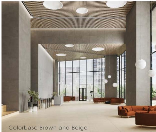
Colorbase Brown and Beige