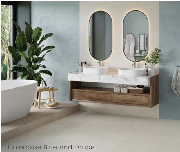
Colorbase Blue and Taupe

An Environmental Product Declaration (EPD) is a standardized document that provides detailed information about the environmental impact of a product throughout its lifecycle. It's a key tool in assessing the sustainability of products, especially in sectors like construction and manufacturing. It is a tool for measuring and communicating the environmental performance of a product across its entire lifecycle.