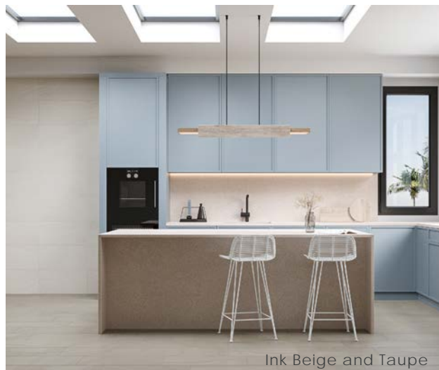
Ink Beige and Taupe