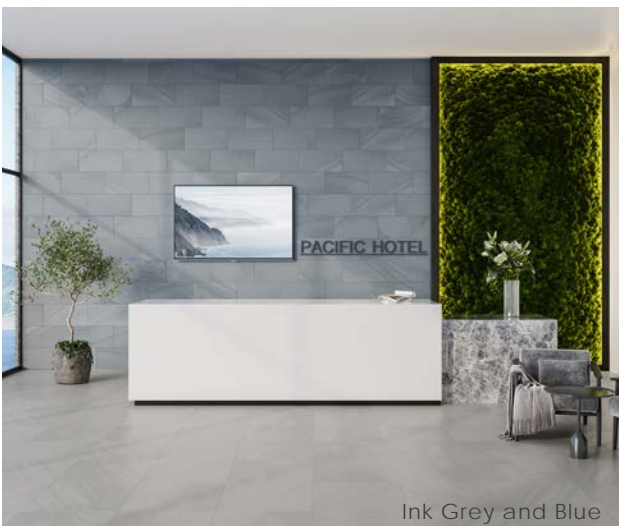
Ink Grey and Blue

Green Squared Certified is a comprehensive, multi-attribute sustainability certification specifically for tiles and tile installation materials. Developed by the Tile Council of North America (TCNA), it's the first standard in the world to assess the environmental and social impact of ceramic tiles, glass tiles, and tile installation materials. It's not just focused on one aspect of sustainability, but rather encompasses a variety of factors including product manufacturing, long-term value, corporate governance, and innovation.