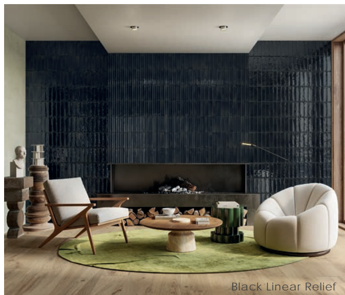
Black Linear Relief