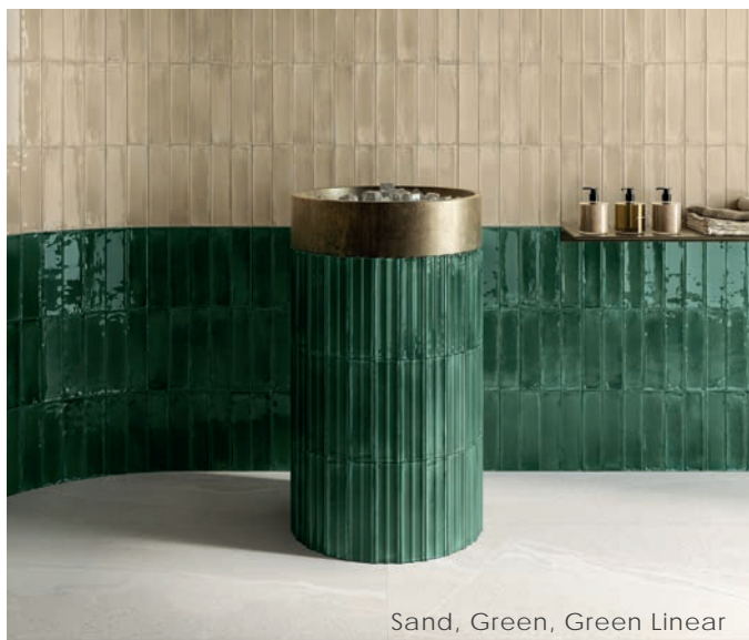
Sand, Green, Green Linear

A Health Product Declaration (HPD) is a standardized tool used in the building industry to report the material contents of building products and their health effects. This tool is particularly important for architects, builders, and consumers who are focused on creating healthy, sustainable environments. It provides detailed information about the chemical ingredients in a product and their potential health impacts.