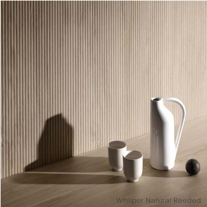
Whisper Natural Reeded

An Environmental Product Declaration (EPD) is a standardized document that provides detailed information about the environmental impact of a product throughout its lifecycle. It's a key tool in assessing the sustainability of products, especially in sectors like construction and manufacturing. It is a tool for measuring and communicating the environmental performance of a product across its entire lifecycle.