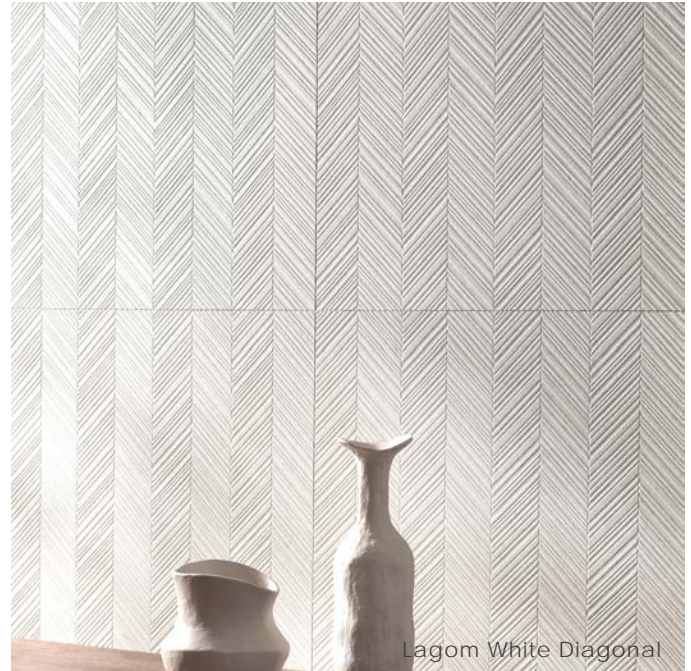
Lagom White Diagonal