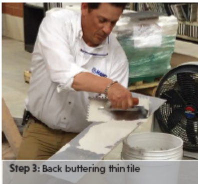
Step 3: Back buttering thin tile