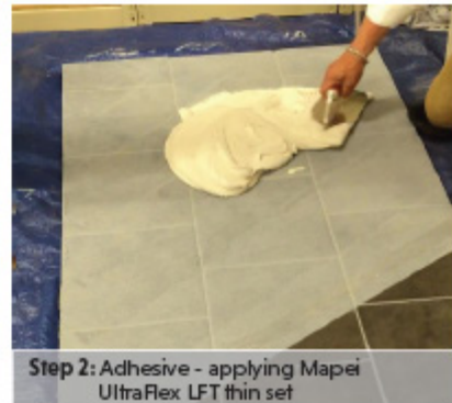
Step 2: Adhesive - applying Mapei UltraFlex LFT thin set