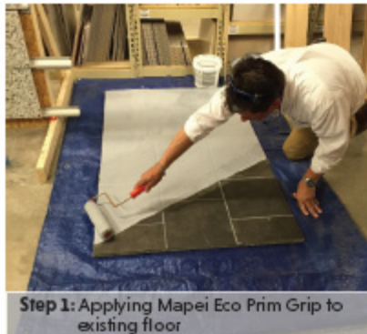
Step 1: Applying Mapei Eco Prim Grip to existing floor

In a gauged porcelain tile installation, thinner tile (generally 6mm vs. 10mm for standard thickness tile) is installed directly over the existing floor tile. Installation is similar in complexity to installing standard tile. The most important element is ensuring that there is full coverage of mortar on the bottom of the tile. The following images and instructions outline how to install gauged porcelain tile.