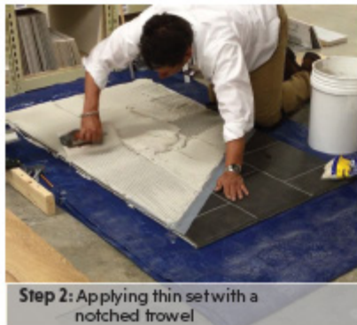
Step 2: Applying thin set with a notched trowel