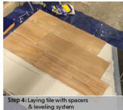
Step 4: Laying tile with spacers & leveling system