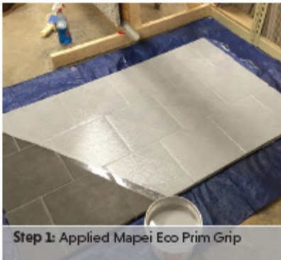
Step 1: Applied Mapei Eco Prim Grip