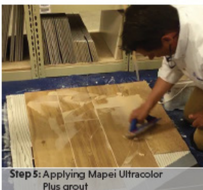
Step 5: Applying Mapei Ultracolor Plus grout