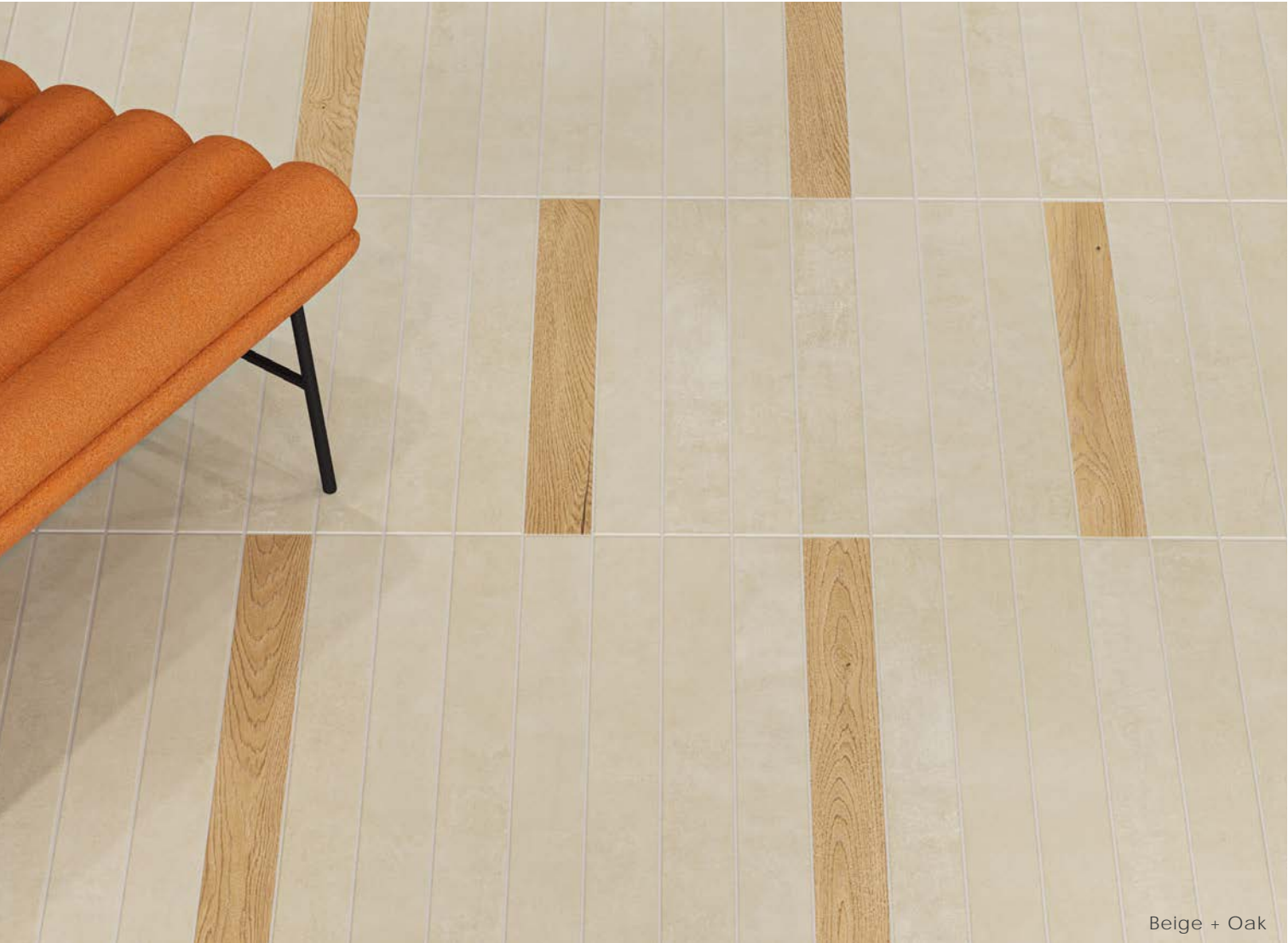
Beige + Oak