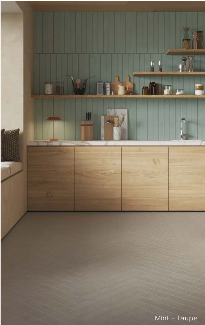
Mint + Taupe