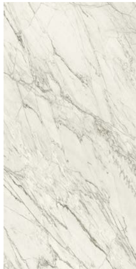
Carrara White Bookmatch