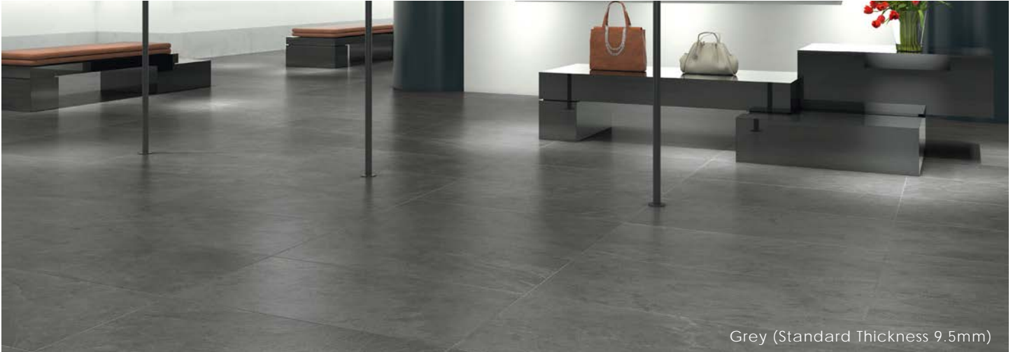
Grey (Standard Thickness 9.5mm)