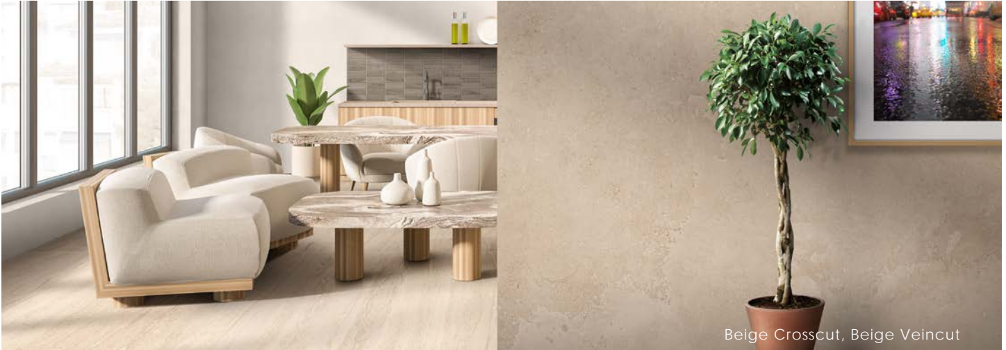
Beige Crosscut, Beige Veincut