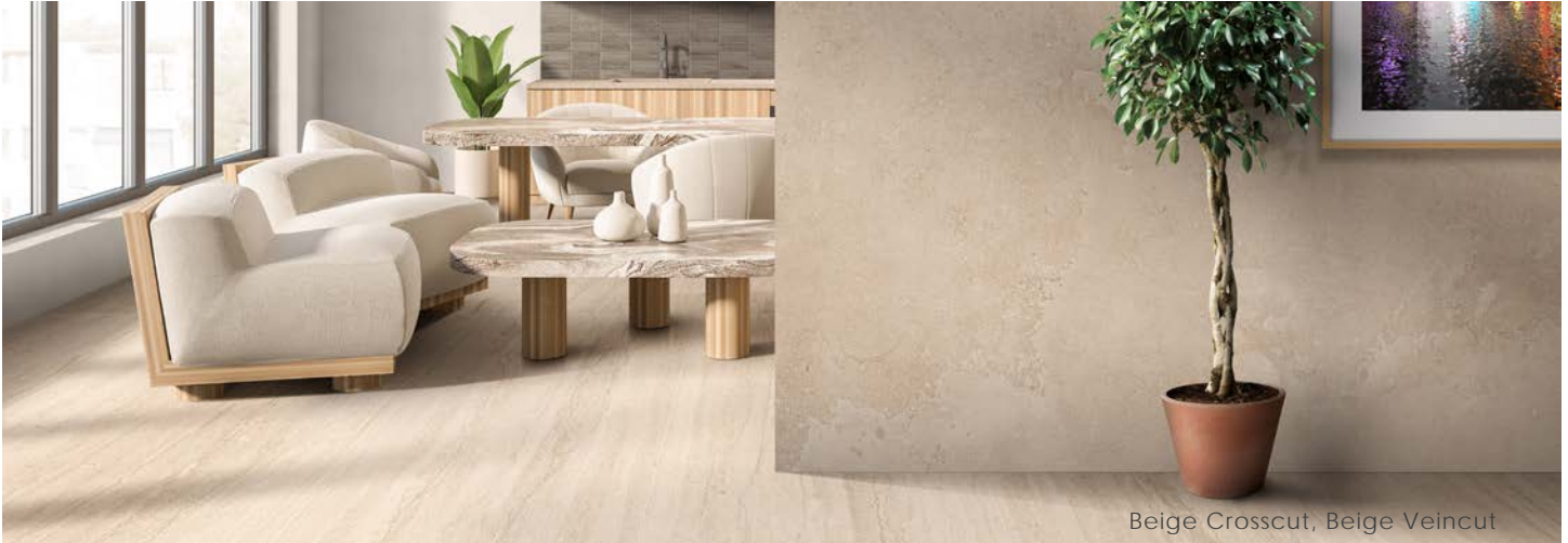
Beige Crosscut, Beige Veincut