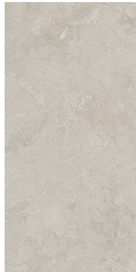
Silver Crosscut Chevron