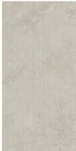
Silver Crosscut Ridge