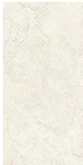
White Crosscut Chevron