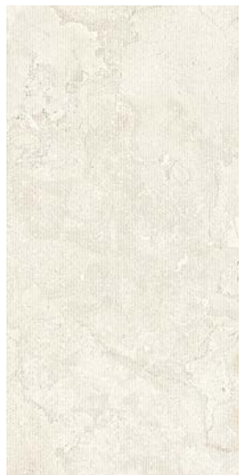
White Crosscut Ridge