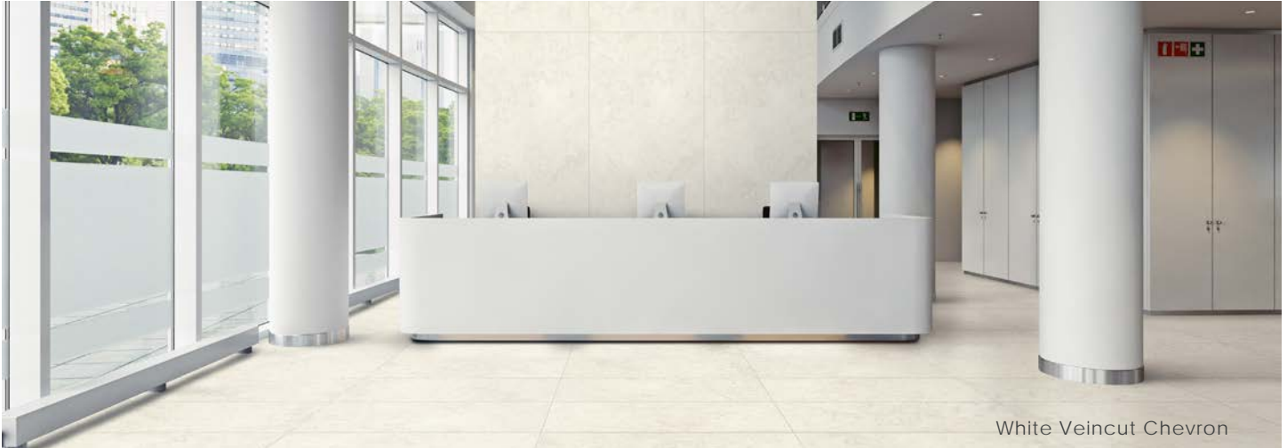
White Veincut Chevron