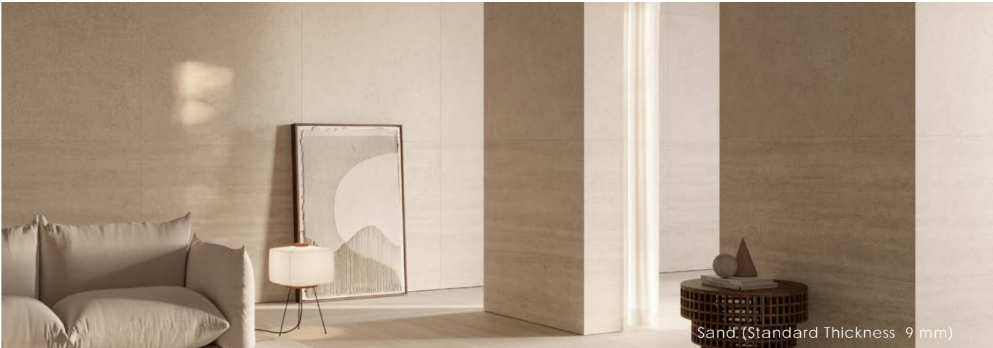
Sand (Standard Thickness 9 mm)

Composite porcelain tile was inspired by the basic principles of mixing and molding the earth with liquid. This mixture is then pressed into timber frames to solidify. This age-old technique was rediscovered by studying historical artifacts, leading to a new surface that exudes an eternal allure.