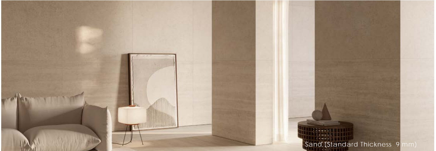
Sand (Standard Thickness 9 mm)