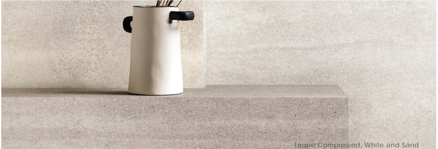
Taupe Compressed, White and Sand