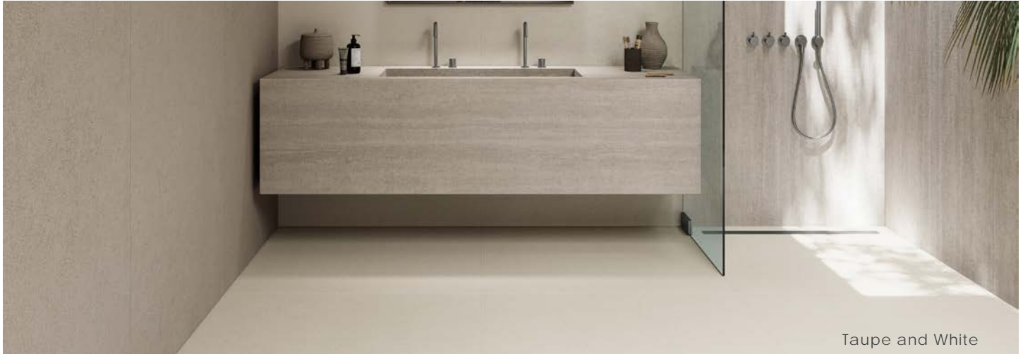
Taupe and White